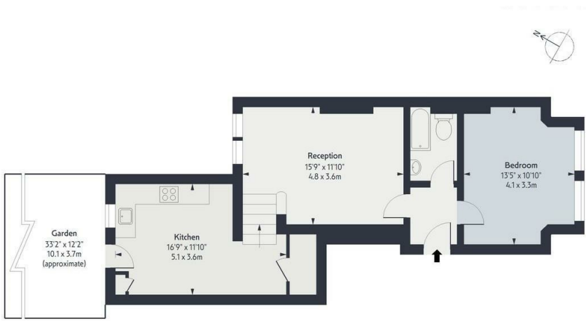
Raised Ground Floor Floor Area 577 Sq Ft - 53.60 Sq M

Measured according to RICS IPMS2. Floor plan is for illustrative purposes only and is not to scale. Every attempt has been made to ensure the accuracy of the floor plan shown, however all measurements, fixtures, fittings and data shown are an approximate interpretation for illustrative purposes only. 1 sq m = 10.76 sq feet.